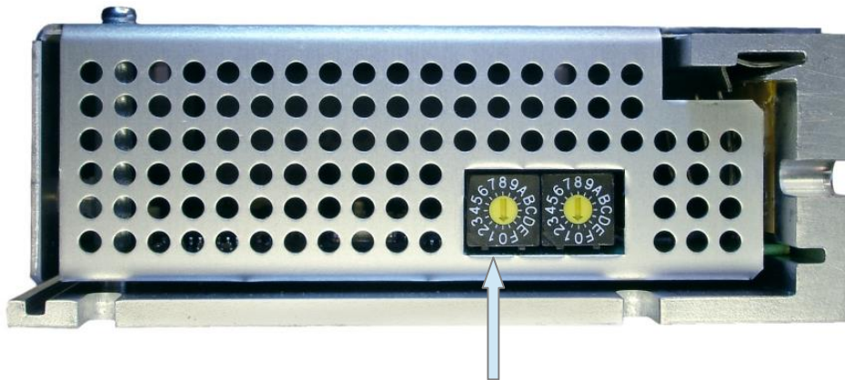
High-value address (factor: 16)

The two rotary switches of the TSP10-PB help to set the profibus address. Set motor current and step size via the parameter data (see 1.3).