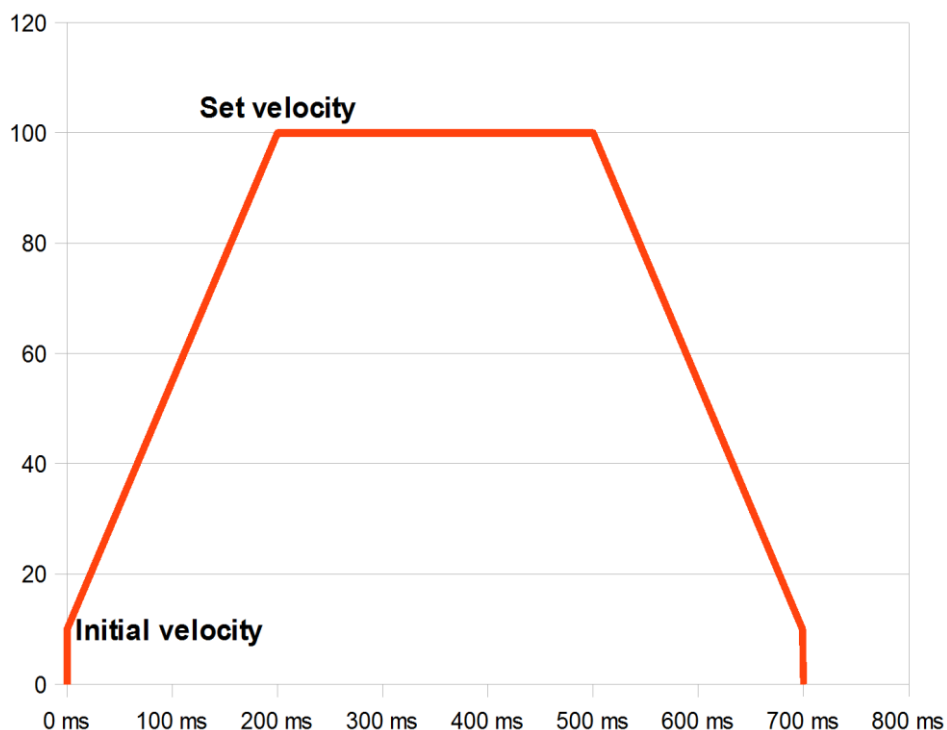
Fig. 1: Velocity profile of a positioning

In byte 5 is given the time base for the acceleration and in byte 6 is given the acceleration time. The acceleration results from the set speed divided by the time for the acceleration. In velocity mode, 100 rpm as speed is used for the calculation of acceleration. The product for the time base and acceleration time results at the time for the speed ramp in milliseconds. Is the product 0 (zero) the acceleration is set to 1 second.